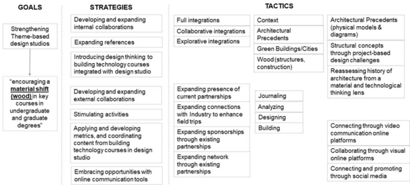
Figure 2. Expanding pedagogical strategies for strengthening them-base design studios: wood as the theme (material shift). Updated and expanded from Armpriest & Manrique (BTES 2017 10 ), Manrique (BTES 2019 11 ), Manrique & Haglund (RS 2019 12 ).

Cross-Laminated Timber (CLT) construction is an emerging technology in the Pacific Northwest highlighted by Kattera’s 2019 opening of a state-of-the-art mass timber factory in Spokane Valley, WA, less than two hours away from our campus in Moscow, ID. The Catalyst Building, located in Spokane, WA, became the first project constructed with CLT panels from the new Kattera factory. 4