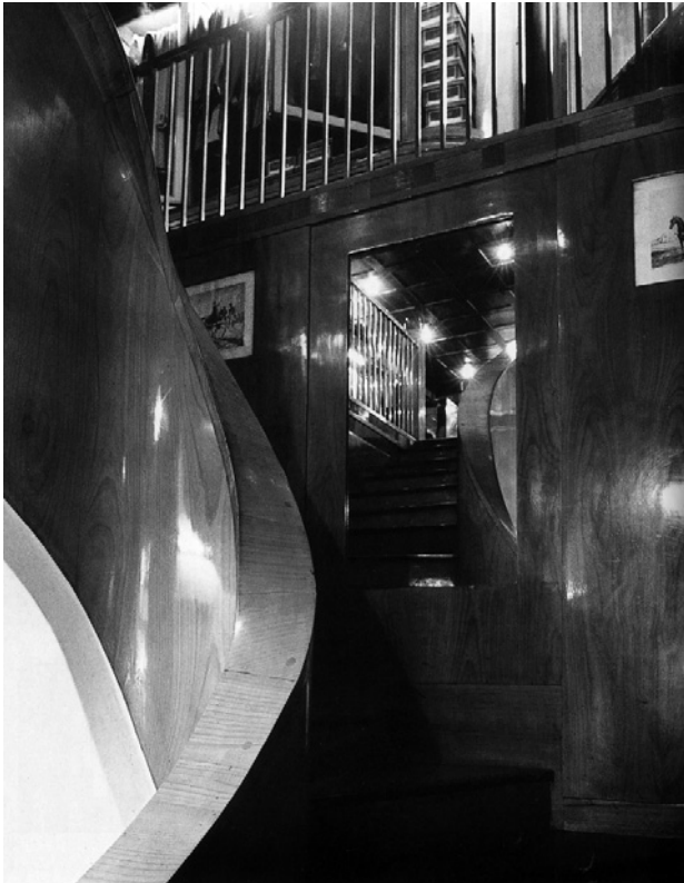
Mirror on landing of the Knize Shop

Loos employed the mirror in the Knize shop in a different manner. This refined interior of cherry wood and brass details contains numerous mirrors that are often difficult to discern. Here the mirror acts not only in a reflective and spatial manner, but also as voyeuristic or security device. There is a mirror placed strategically on the landing of the customer's stair that allows the store manager to see who is entering the shop from his office on the second floor. Beyond the spatial and voyeuristic qualities of the mirrors, they worked well in this space in that they also allowed the customers to continually see themselves in their new finery.