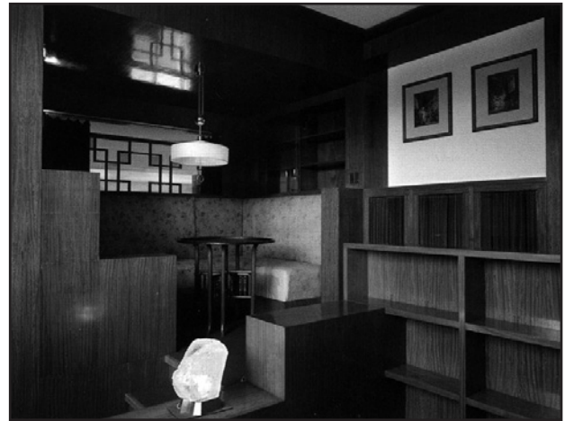
Boudoir of Villa Muller

lada Muller. It is telling that these most exquisite materials are used in the heart of the house, the private space for the woman. The spatial development of the boudoir is in many ways of the villa itself. Each volumetric unit within the room (like each room within the villa) is charged with a discernable interiority. The Villa Muller was the last of Loos's garden villas and this room, which is often described as a jewel box, perhaps more than any other, typifies his ideas of space and materiality.