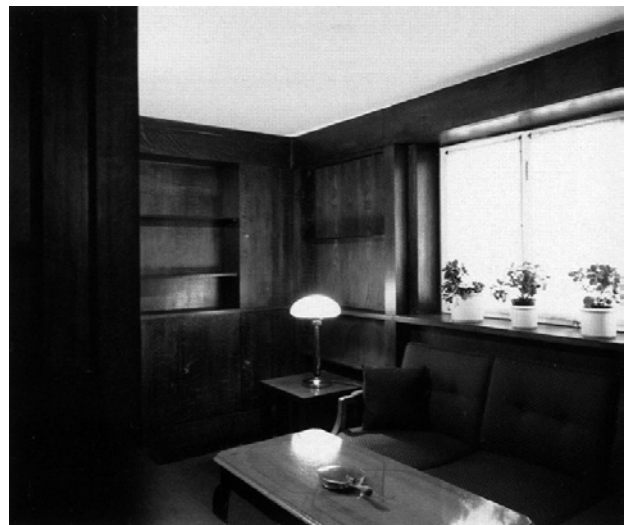
Library of Villa Moller

Other buildings where Loos employed marble as a type of ornamentation were the Villa Karma, the Duschnitz Villa, the Strasser Villa and the Villa Muller. It should also be noted that Loos typically used marble as a cladding and not as a structural material.