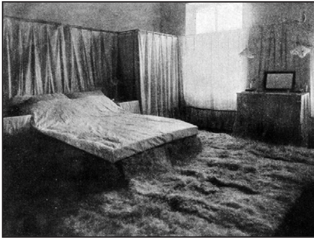
Lina Loos's Bedroom

this room was covered with a pale blue wall-to-wall carpet, above which a large Angora rabbit fur rug lies. This rug occupied most of the floor and continued up over the bed. Loos saw fur as the original textile; it was the first fabric that man used. The walls were completely covered to the door height by white curtains in "Batist rayee". There were soft wood cabinets that were hidden behind these curtains. This bedroom, which Loos used until the end of his life, was the ultimate intimate space and was so direct and immediate in addressing an archaic drive and instinctive needs.