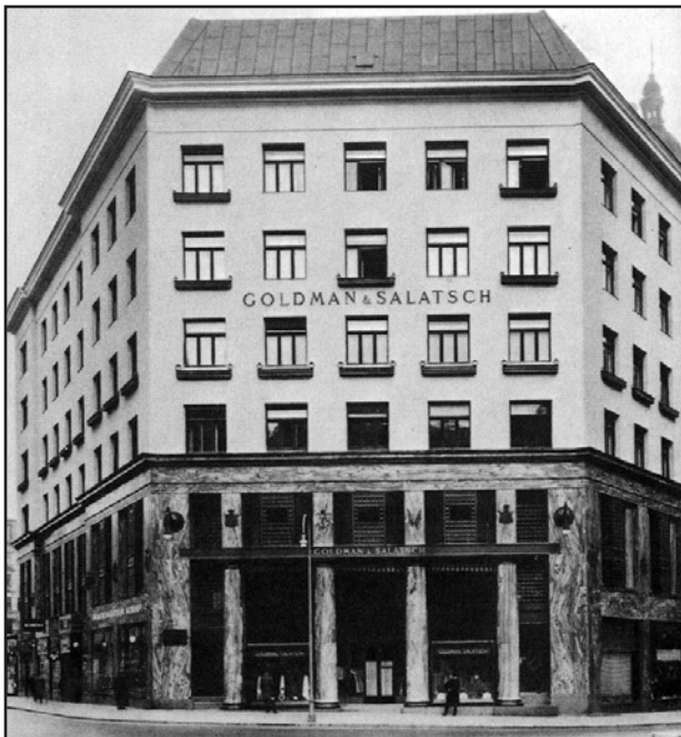
Looshaus on the Michaelplatz

The Looshaus on the Michaelerplatz was another project where Loos used marble in an ornamental fashion. He used Skyros marble in the interiors in the same way that he used it on the exterior pillars of the Karntner Bar; as a graphic device. On the base of the exterior façade, Loos employed Cipollino marble in a different manner and as a direct reference to Rome. The Romans had made extensive use of this marble and Loos attempted to draw a connection to the Romans by using this marble and also by using classical forms. Since Loos rejected the ornament of the 19 th century that was so prevalent in Vienna, he was again facing a design dilemma; how was he going to dress the bottom of this building in a way that worked with its consumer function. Loos, having spent time in Chicago, was very aware of the ornamentation that Sullivan had used as an attention getting device in the Carson Piere Scott building. He realized that something