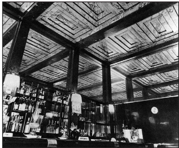
Mirrors of the Karntner Bar

qualities. Loos first used mirrors in the Hirsch and Schwarzwald apartments where large plate-glass mirrors combined with freestanding pillars creates a perceptual oscillation between the virtual and real mirror image of the space. (9) Loos typically used the mirror as a method of extending space. This is most clearly seen in the Karntner Bar in Vienna, where the illusionistic clerestory helps to expand the upper volume of the space. When sitting in the Bar however, it is easy to image that there are other Bars next door and you wonder exactly what is happening in them. This explosion of space above eye level serves this small interior well.