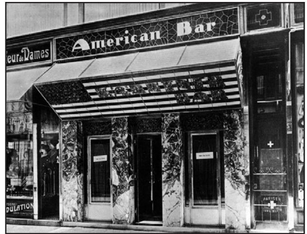
The Karntner Bar

His father, who was a sculptor and stonemason, is often credited with providing Adolf his love of beautiful materials and meticulous details. However, since his father died when he was only nine years old, we must assume that Loos's use of precious materials was perhaps more of a remembrance. Loos's early education was fraught with difficulties. It began in 1884 when he entered the Obergym-