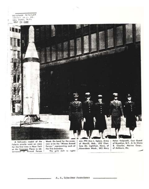
Fig. 3. Polaris missile and five Miss Armed Forces on display in front of the Seagram Building, 1962

Such an intersection – between the bomb, the military, and big business – was made even more apparent in 1962 when on Armed Forces Week a full-scale model of a Polaris missile was placed in the Seagram Building plaza (Figure 3). Accompanied by five "Miss Armed Forces" (beauty queens chosen from each branch of the military) the missile was on view for the first time in New York City. 28 That it went on display at the Seagram Building, and not in front of some government or civic structure is critical in assessing the relationship between corporate America and the expanding military-industrial complex during the Cold War.