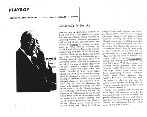
Fig. 4. Mies featured in Playboy, August, 1958

Just as the Polaris missile epitomized the technological power of the military, the Seagram Building was an example of the innovative forces, both technological and imaginative, driving American capitalism. It was a heady mix of sex and power in the form of beauty gueens and bombs set on the stage of a skyscraper with all its own peculiar phallic metaphor. It was not the only time in the early years of the building that its strong right angle architecture was linked with sex. A short piece in Playboy magazine from 1958 titled "Slenderella in the Sky," featured a photograph of a typically stern Mies (Figure 4). If calling the building "Slenderella" implied a feminine association, however, the copy accompanied the piece curiously begins: "One of the latest giants to thrust its head into New York's skyline is a stern but startling 38-story edifice sheathed in stunning bronze." 29 Other advertisements cast the tower as female, calling it "shapely" and adorning it with women's sunglasses, but—whether Slenderella or a thrusting giant, host to Miss Armed Forces or a missile—sex, the bomb, and modern architecture offered an irresistible mix. 30